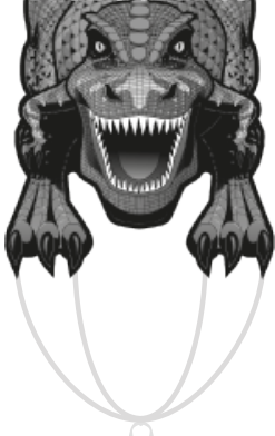
Front of Kite

7 In stronger winds, tie SkyTails® together for more stability.