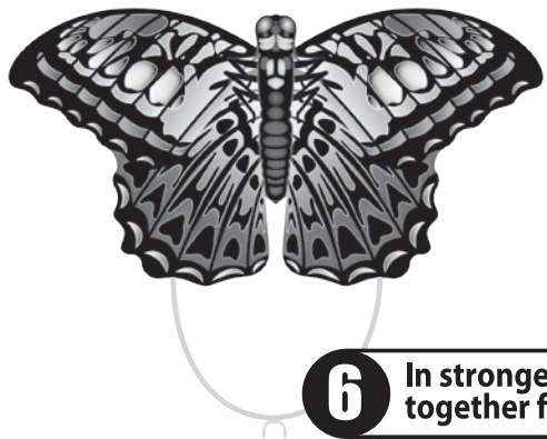
Front of Kite

6 In stronger winds, tie SkyTails® together for more stability.