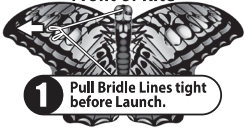
Front of Kite

1 Pull Bridle Lines tight before Launch.